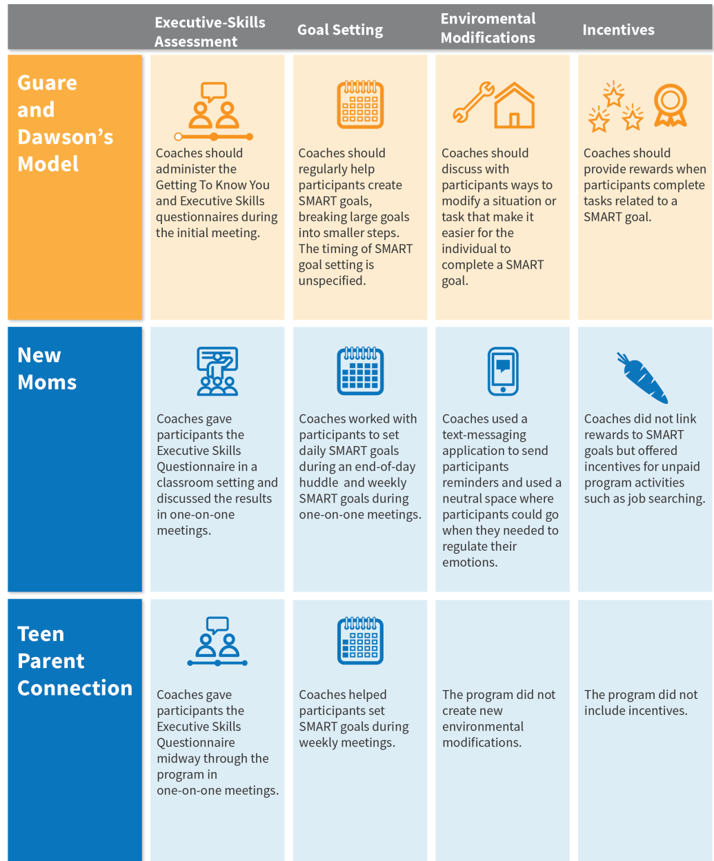
Figure 3 Implementing the Executive-Skills Coaching Model at New Moms and Teen Parent Connection